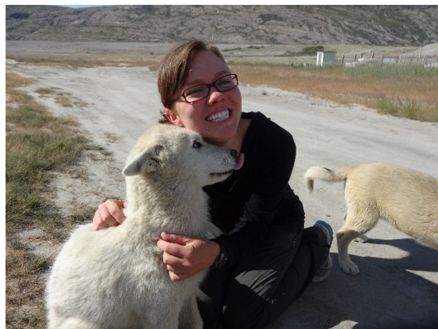
Summer research in the Arctic! Kangerlussuaq – a small town in western Greenland